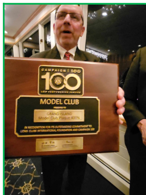
Pictures from our Lions Club Christmas party held on December 12th at the Buffalo Launch Club. At the Christmas Party we collected about 30 lbs. of food and over $500.00 in checks and Tops gift cards for the Neighbors Foundation. Our Club was presented with a campaign 100 plaque recognizing our service to LCIF making us a "Model Club."